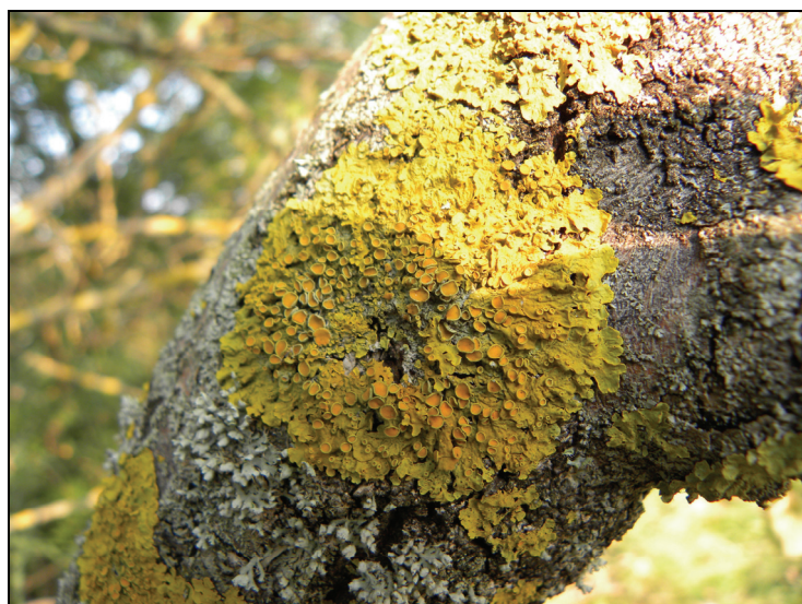
Figure 2. Xanthoria parietina on a corticolous substrata.

Generally, it was observed that the central parts of lichens have accumulated higher concentrations of heavy metals than younger parts (Table 4).